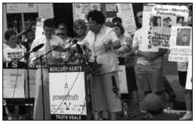
Diane Watson (D-CA), Committee on Government Reform, talks about mercury in vaccines and the dangers of environmental toxins.

National Media Coverage — NVIC issued a national press release before the rally and participated in radio and TV interviews. On the day of the event NVIC joined with SafeMinds and eight of the co-sponsoring organizations in a joint