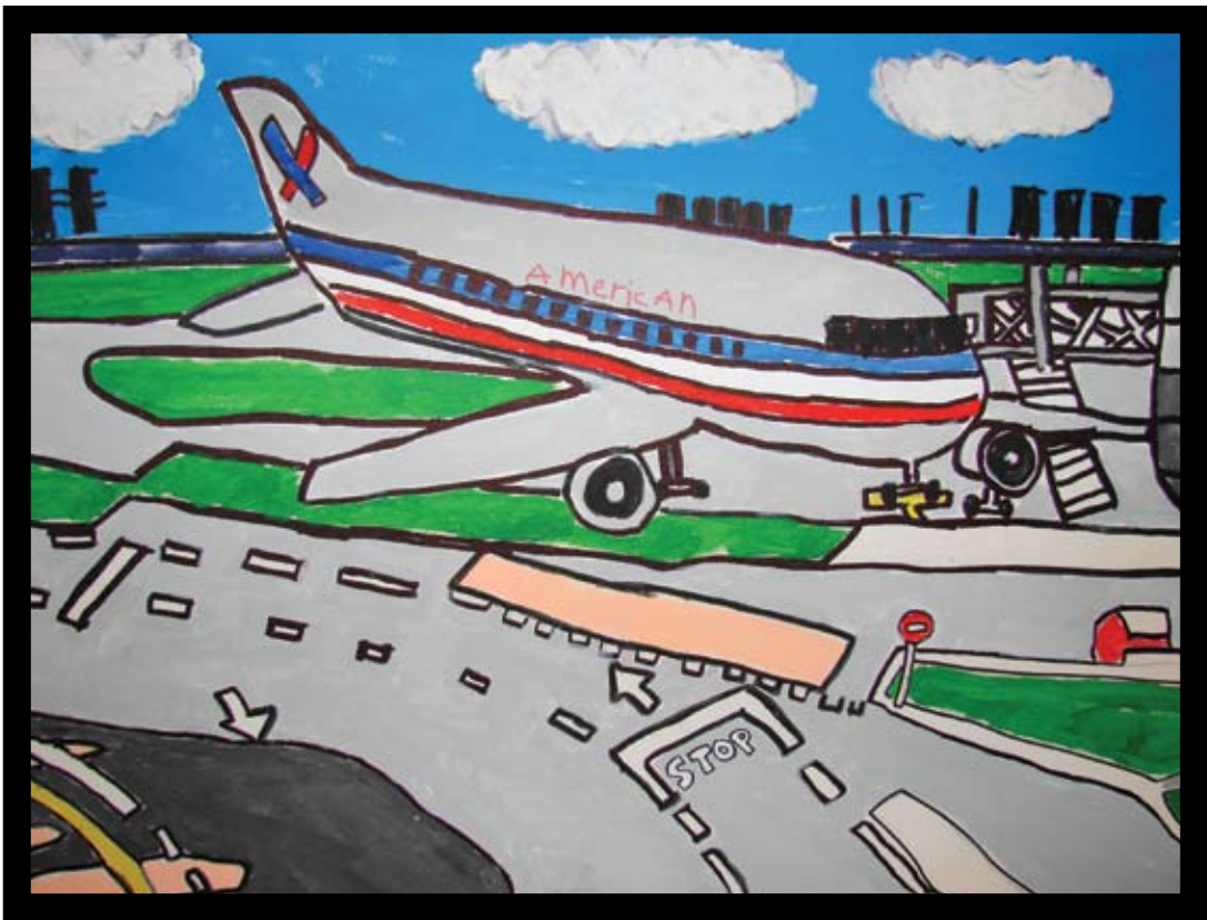
American Airplane Home from France 2009