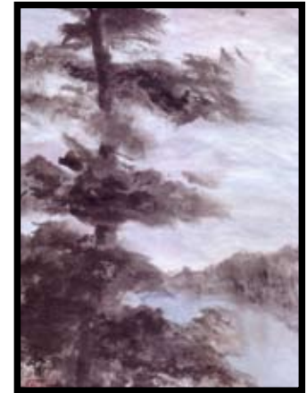
Along the Shore